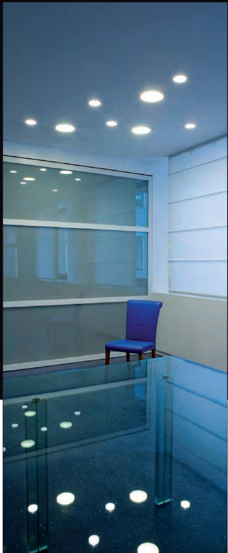
FC Inter - Sede dirigenziale Stefano Boeri Architetti