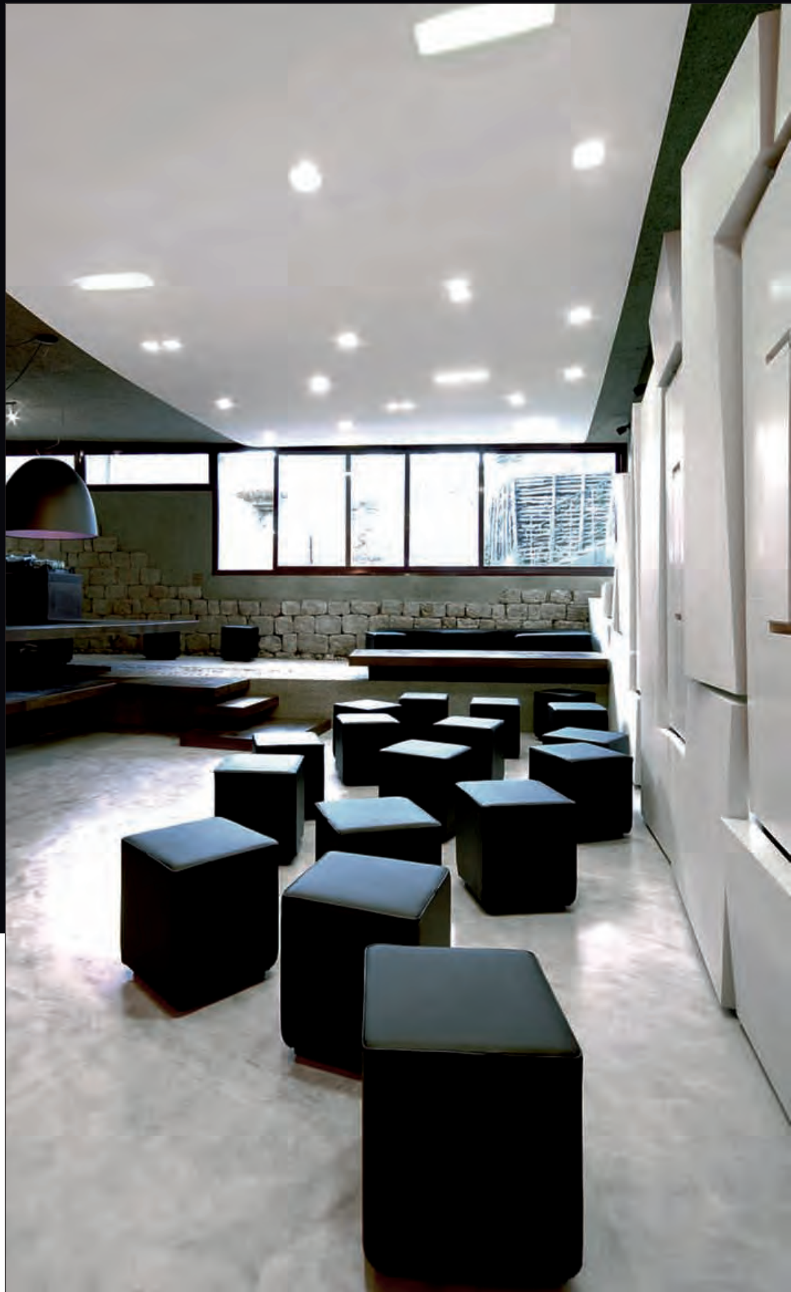
Castello Colle Val d'Elsa ASZ Partners