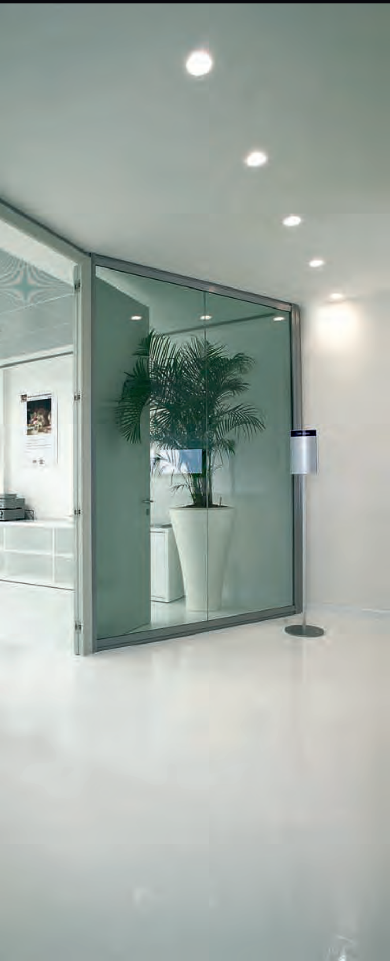
San Pellegrino Arch. Mazzatorta